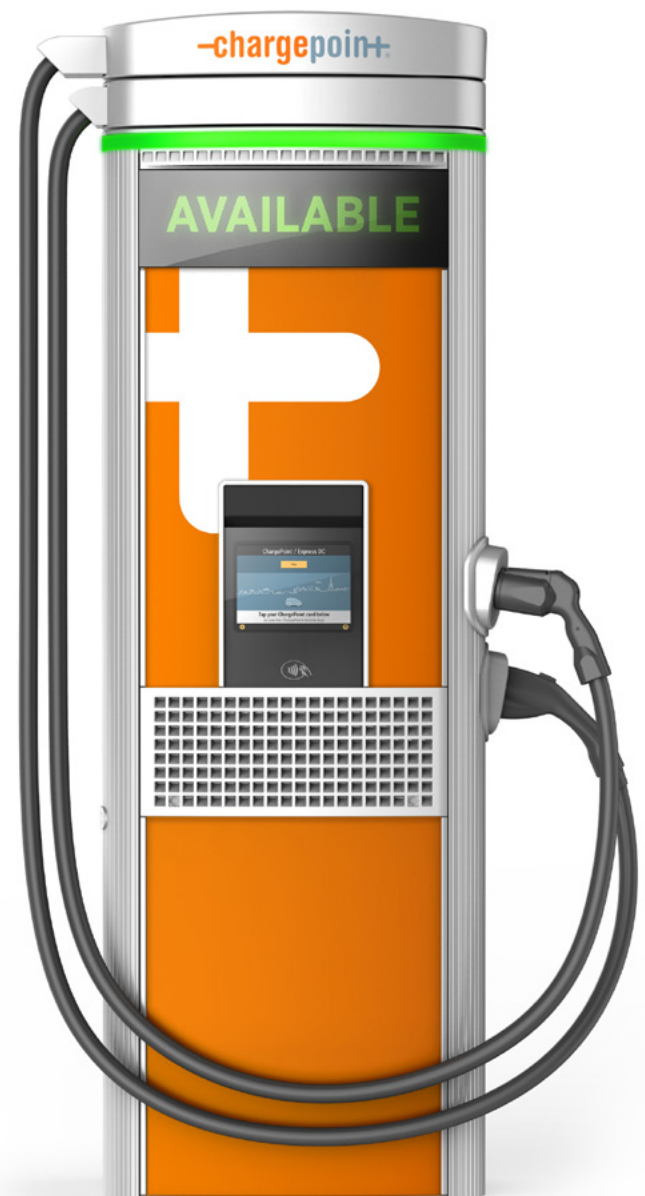
Express 250 Station

Fault-tolerant design, instrumentation for remote monitoring and intelligent diagnostics allow the world-class ChargePoint support team to provide proactive alerts to prevent station outages and eliminate driver frustration.